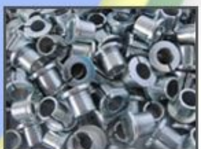
Trivalent Blue Zinc