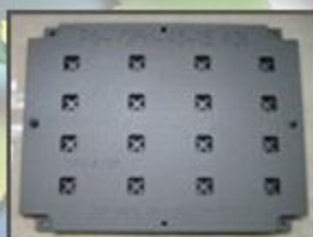
Hard Clear Anodize