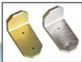
Yellow & Clear Alodine